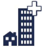
Smart Home & City